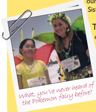
What, you've never heard of the Pokemon fairy before?