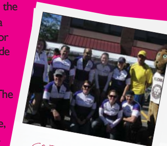
Go Team Big Sister!

October 4 was the perfect day for a leisurely 25, 50 or 100 mile bike ride around southeastern Massachusetts. The sun was shining, the sky was blue, and there was a hint of fall in the air that mixed nicely with the excitement of Team Big Sister as they geared up for this year's Rodman Ride for Kids.