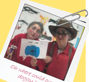
Oh where could our doggy be?