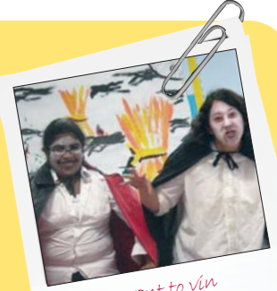
Vee vant to vin Scariest Costume!

Big thanks are in order for Harvard Pilgrim Healthcare Foundation for sponsoring this year's party. With continued support from individuals, corporations, and foundations, we are able to not only make and support more quality matches, we can also offer them enjoyable no-cost activities such as this one. We look forward to seeing all our matches back again next year, and cannot wait to see those Little Sisters who are ready to be matched come back with a Big Sister of their own!